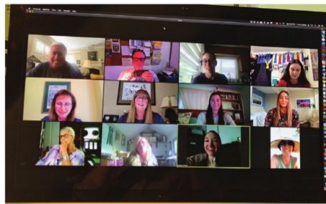
Many of the Sidelines magazine team had planned to meet at #LRK3DE 2020 but when it was cancelled we did the next best thing and had a Zoom party so we could still be together. It was great fun, but hoping next year we can all be there in person!